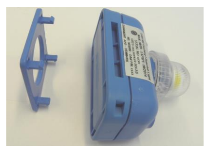
Light and Fixing clip separated to show material path.

The Dan W2 is supplied with a fixing clip. The clip is intended to be placed behind a strip of lifejacket material or reflective tape; the light is secured by pressing it into the clip.